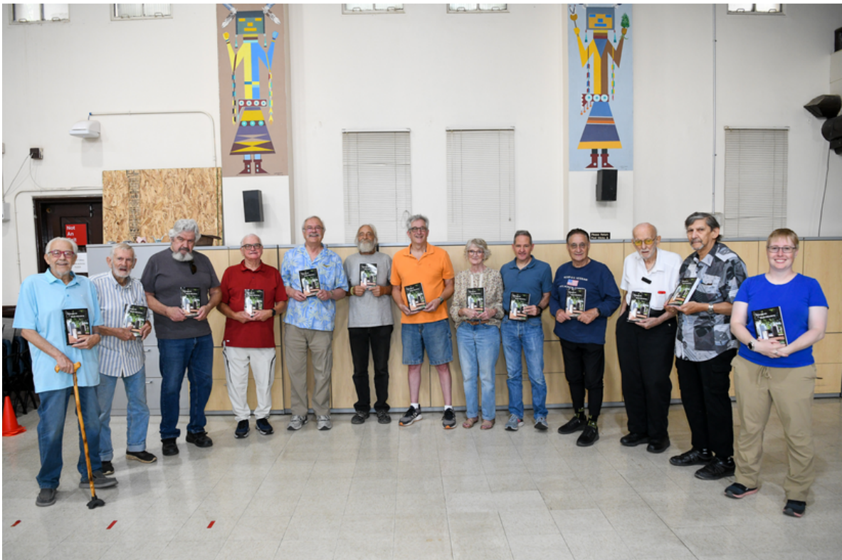
The VA Writers' Group holding copies of Holes in Our Hearts