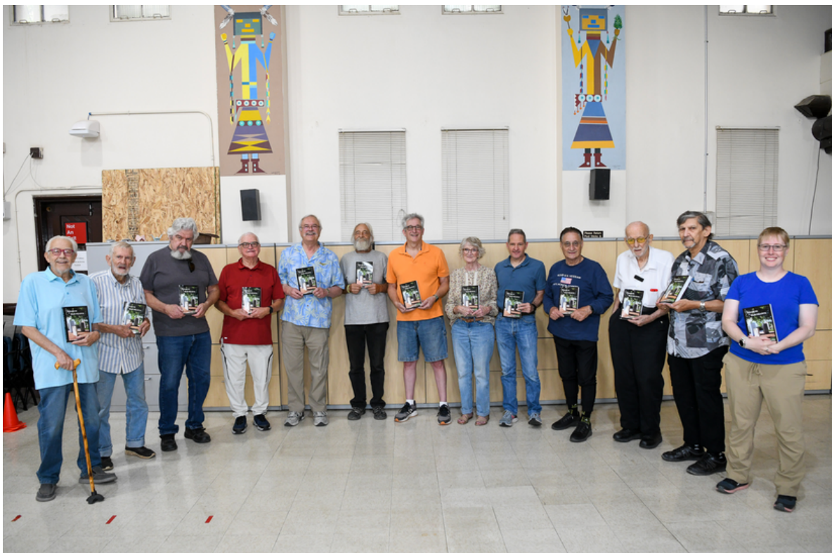
The VA Writers' Group holding copies of Holes in Our Hearts

NMPW members can assist in recruiting veterans as students for this project. Tell them to contact jimtritten@comcast.net . SWW plans to apply to NMA in 2025 to produce another anthology using memoirs produced during the course, as well as submissions from other New Mexico military and veteran family members and caregivers.