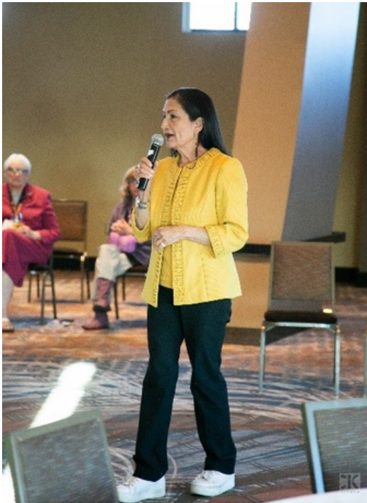
Gubernatorial candidate Deb Haaland addressing the reception guests