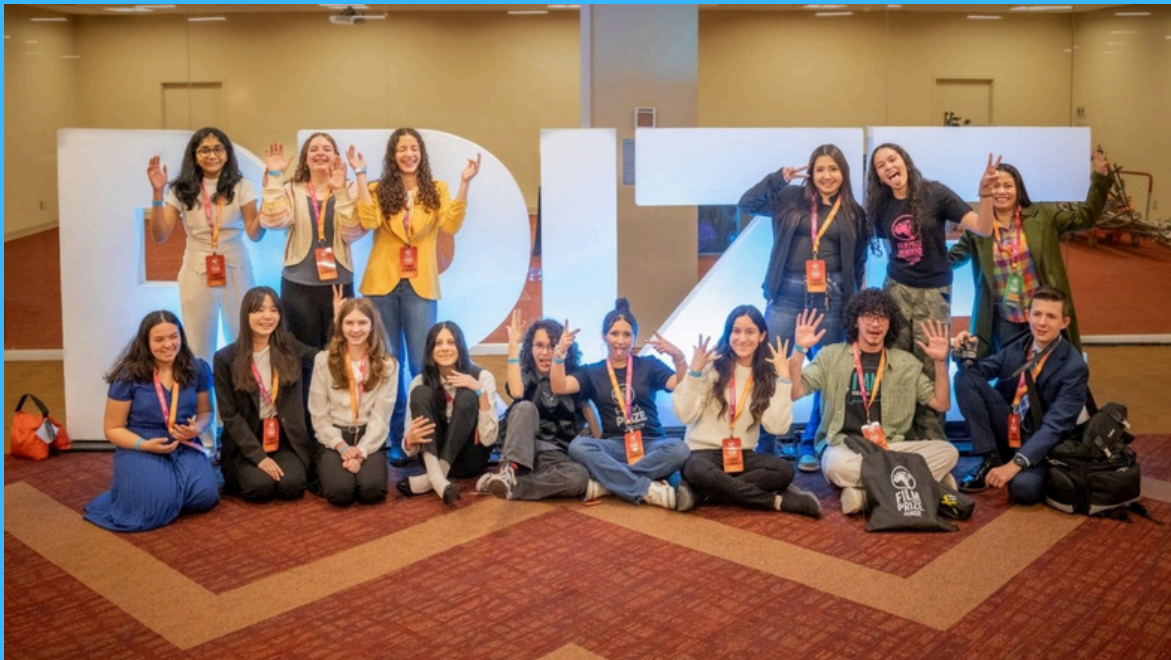
The students after receiving the Founder's Circle Award.

These amazing young journalists are not only excelling in print journalism and broadcast media, but also in filmmaking. One of their films also received the Film Prize Jr. of New Mexico—Founder's Circle Award for Best Film in the middle school division during the Film Prize Jr. of New Mexico Film Festival.