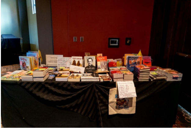
Members' books on display (and for sale) at the Conference