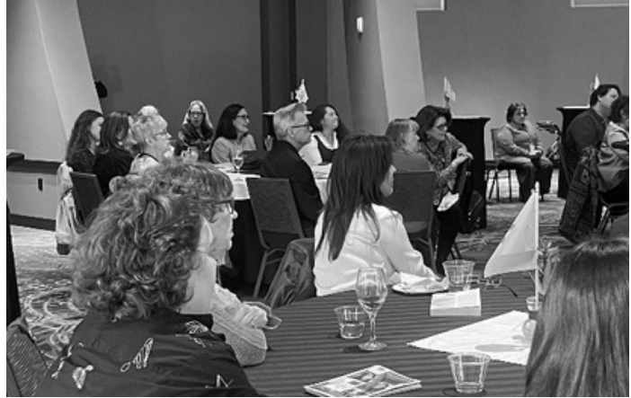
The Audience at the Slam Poetry Performance